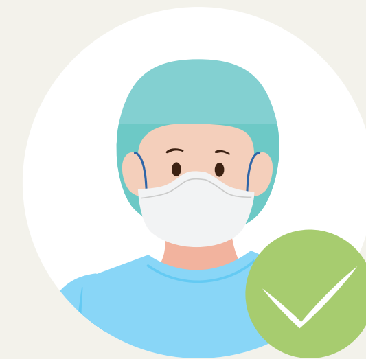
Surgical mask (for all patient interaction) or an N95/P2 mask during other procedures