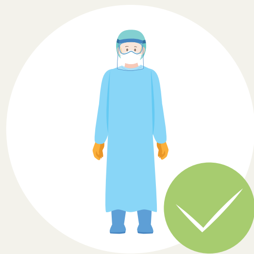
A long-sleeved gown